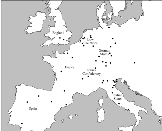
MAJOR PRINTING CENTERS IN EUROPE, 1452–1500

Each dot represents a city that produced at least 50 different books or book editions during the period 1452–1500.